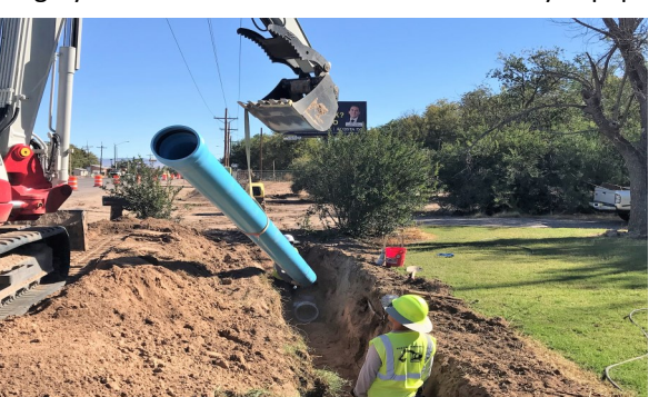
File Construction Installing 12 inch Water Line.

The project was awarded to File Construction in the amount of $520,240.60. The project is funding by the Colonias Infrastructure